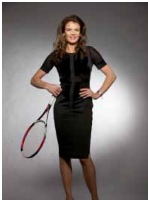
Former No.1 Tennis Player and Celebrity Mrs. Annabel Croft

play in hot weather, whilst the clay courts provide players with an additional choice of surfaces to train on; both of which are used in tennis tournaments throughout the world and recognized as championship standard].