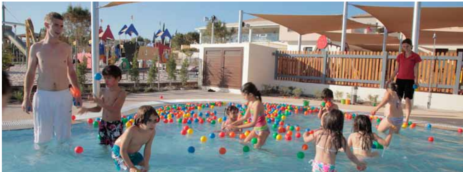
New Pirates Village at the InterContinental Aphrodite Hills Resort Hotel - See Page 4