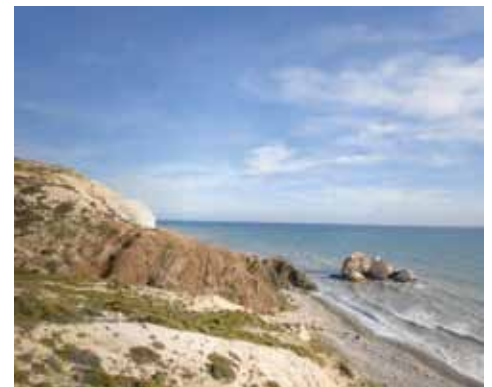
Aphrodite's Rock, Paphos, Cyprus

How the UK will perform for Cyprus in 2012 is anyone's guess. Bookings have started off well but, yet again, they always do. It's the old faithful who return again and again but, once we get to March, it's Greece, Portugal and Spain which make the running and Cyprus gets left behind. Cyprus is still not good value for money for the British tourist.