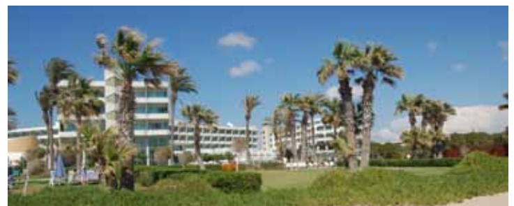
Louis Imperial Beach Hotel, Paphos

To join next year's trip visit: www.linedancingholidays.co.uk