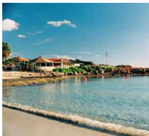
Ayia Napa, Cyprus

The more Cyprus falls out of fashion with the UK travelling public, the more are our members vital to maintaining the flow of tourists to our home country. Recently, the CTO announced their 'AMBASSADOR' initiative in order to generate interest in the island. Of course our members have been ambassadors for many years and though fewer in numbers, they still account for nearly 200,000 visitors to Cyprus annually.