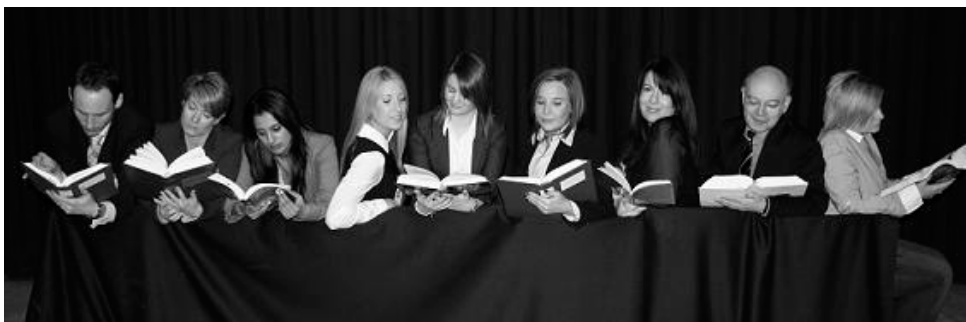
Pictured: The team of expert Travlaw Solicitors